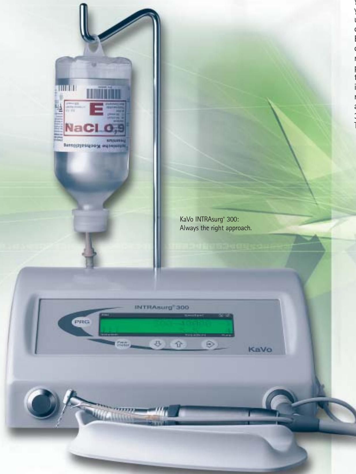
KaVo INTRAsurg® 300: Always the right approach.

KaVo INTRAsurg 300: completely tailored to your needs.