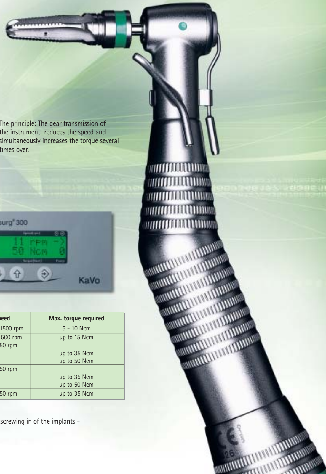
KaVo INTRA C3-C09: The modern contra-angle handpiece with separate head (3:1) and shank (9:1)

The principle: The gear transmission of the instrument reduces the speed and simultaneously increases the torque several times over.